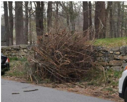
Jumble of Tangled Vines

Here is what we left for the Town of South Berwick to pick up; the town reportedly completed this the very next day!