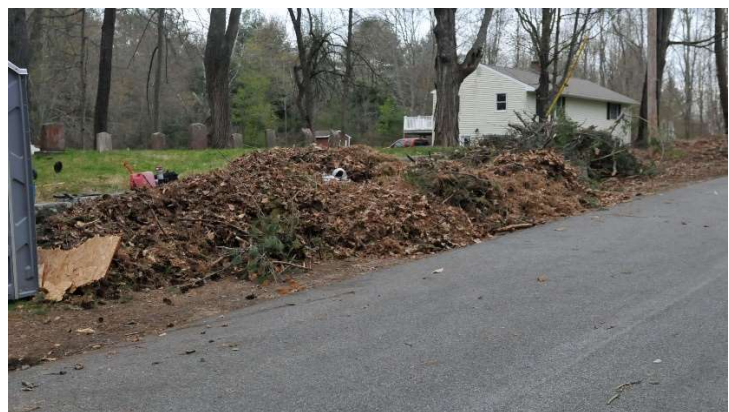
Lots of Leaves, Pine Needles, Pinecones, Branches and Sections of logs